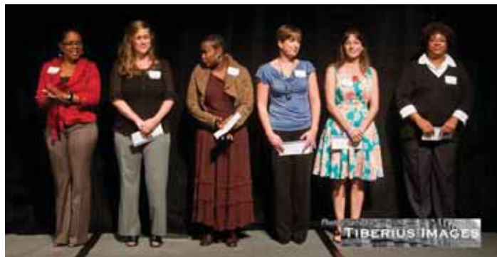
Six women over 30 who have returned to school were awarded ATHENA Scholarships in 2010.

The ATHENA Scholarship program supports women over 30 who are working toward their college degree. These scholarships are unique in that they can be used for whatever helps a woman achieve her academic goals, whether that's tuition and books or childcare and transportation expenses.