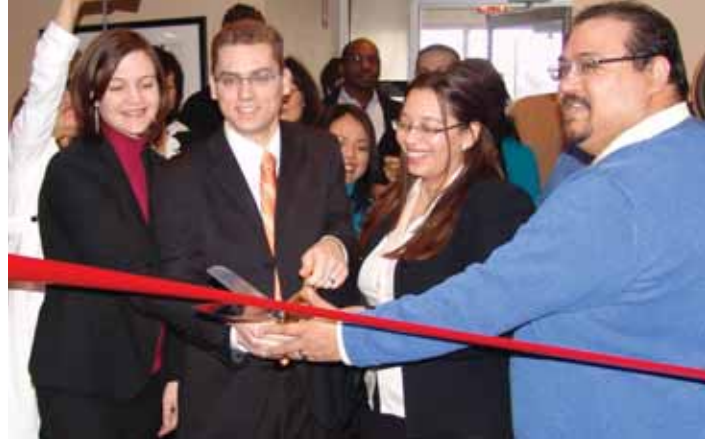
Avanti Law Group, PLLC held an open house and ribbon cutting event to celebrate the relocation of their offices to 600 28th St. SW in Wyoming.

Congratulations to the following Chamber member who recently had reasons to celebrate! If you have a groundbreaking, grand opening, product launch event or other reason to celebrate, Visit www.grandrapids.org/ribbon-cuttings . We even bring giant scissors!