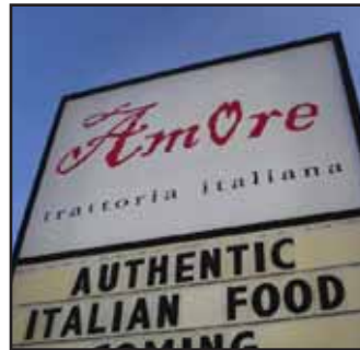
For authentic Italian fare in Grand Rapids, visit Amore Trattoria Italiana on Comstock Park.

If you want a restaurant that offers everything Italian, Amore Trattoria Italiana is the place to visit. In addition to offering a stellar seasonal menu, Amore has live bands, free cooking classes, and specialty cakes. Their wine selection is exclusively