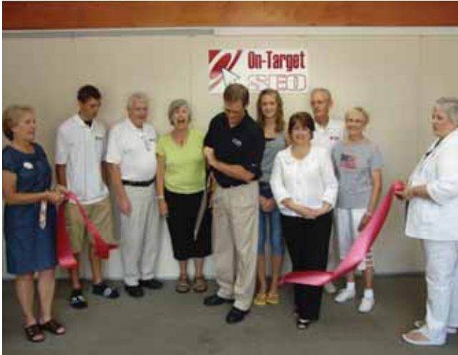
On-Target SEO celebrated their one-year anniversary with a Chamber ribbon cutting.

Congratulations to the following members who celebrated grand openings, anniversaries and new additions! If you have an upcoming groundbreaking, grand opening, product launch event or other reason to celebrate, visit www.grandrapids.org/ribboncuttings to see how we can help. We even bring the giant scissors!