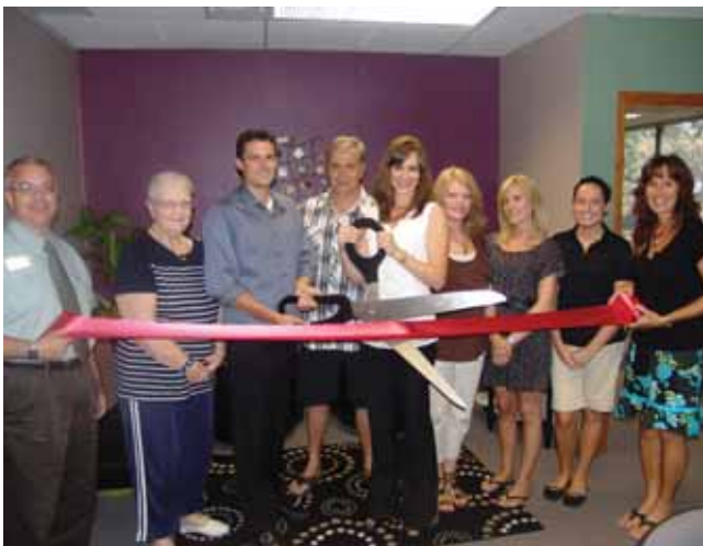
A grand opening celebration was hosted by Clear Connections Chiropractic.