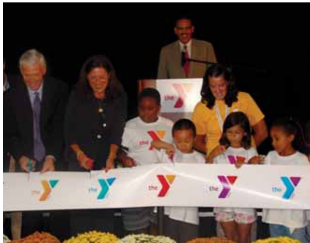
YMCA of Greater Grand Rapids recently dedicated their new location, the Spartan Stores YMCA in Byron Center.