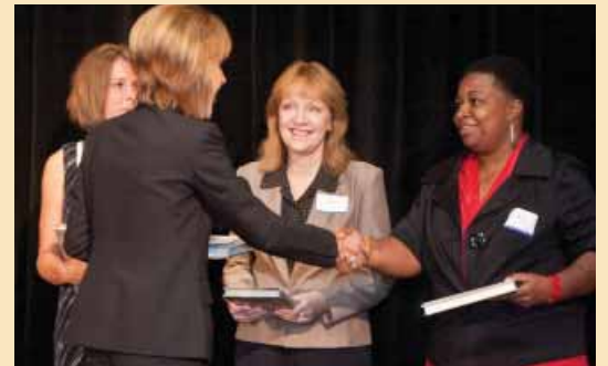
ATHENA Scholarship recipients are presented with their checks at the annual ATHENA Award event.

The ATHENA Award Celebration will also feature the presentation of six scholarships to area women over the age of 30 who are working to complete undergraduate and post-graduate degrees. A component added to the ATHENA program in 2000, the scholarships are unique in that they can be used for whatever helps the recipient most, whether that's tuition, books, child care or transportation expenses.