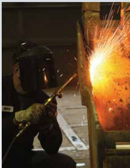
Let the sparks fly. To celebrate its 40th anniversary, The FABRICATOR has decided to share its FAB 40 list of successful U.S. metal fabricating operations.

To our knowledge, no other magazine has attempted to put together such a list. We also realize that this list will be very fluid as we hope more companies want to be a part of this public effort to highlight the economic impact that metal fabricating has on the U.S. economy.