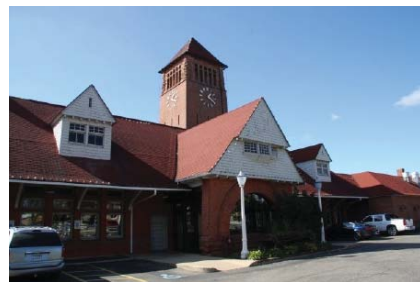
Clara's on the River