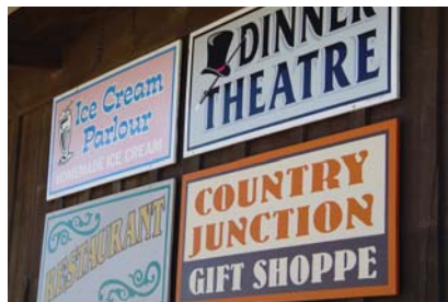
Cornwell's Turkeyville USA