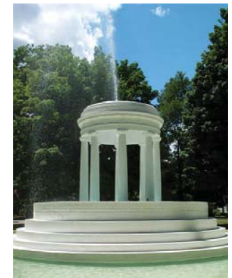
Brooks Memorial Fountain