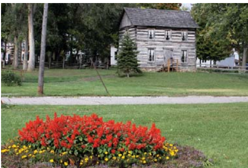
Dr. John Harvey Kellogg Discovery Center & Historic Adventist Village