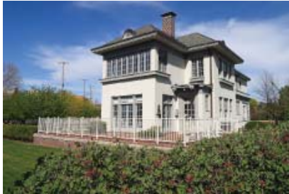
W.K. Kellogg House