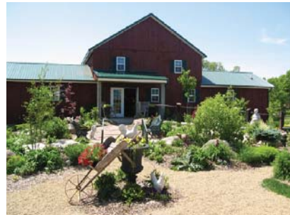
Southern Exposure Herb Farm